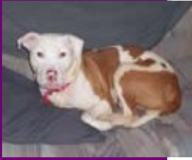
Guinness, a gorgeous pit bull, just one of Roxie's recent adoptees.

"Away from the scary kennel, Saul was a different dog! So happy and friendly!"